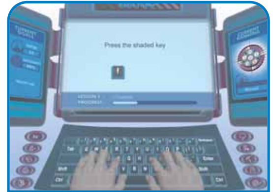
3D hands help students identify the correct hand placement and reaches to new keys.

Teachers and parents will appreciate the real-time record-keeping, including progress graphs and reports on lessons, activities, and assessments. Teachers can analyze student errors by hand, finger, and key to pinpoint problem areas. The new parent report, accessed from the student login, allows parents to track their child's progress and scores throughout the program.